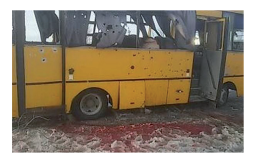
Civilian bus hit in Volnovakha attack<sup>41</sup>