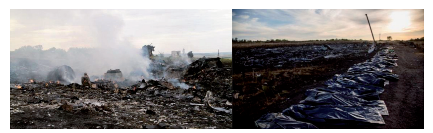
Wreckage of Flight MH1726 and body bags containing remains of the victims<sup>27</sup>