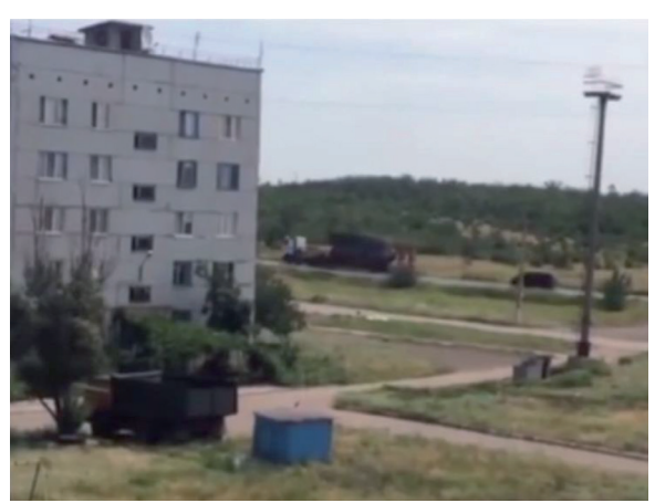
Image from a video in the possession of the Joint Investigation Team, showing Buk missile near Donetsk in transit to launch site<sup>34</sup>

54. After the attack, the DPR returned the Buk system to the Russian Federation. When the Buk system was seen returning to the Russian border, having performed its function, it was missing at least one missile<sup>35</sup>. There is no evidence that Russian authorities investigated, arrested, or punished those who supported this act of terrorism.